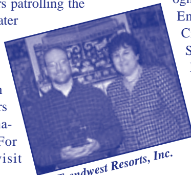
Trendwest Resorts, Inc.

Congratulation to these companies and their employees for their ongoing commitment to reducing traffic congestion and pollution!